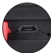
USB charging interface