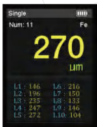
Measure past value page